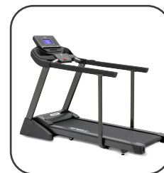
Optional Extended Handrails